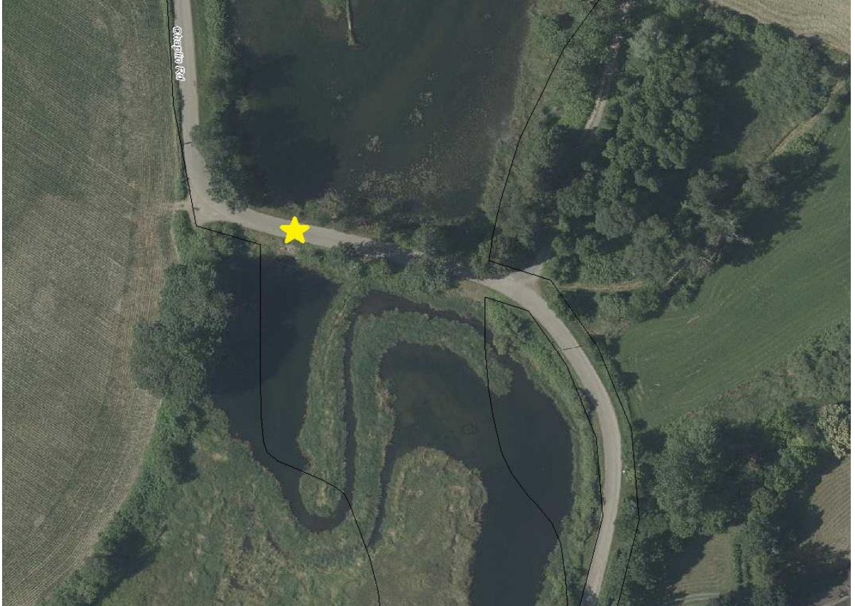
Aerial view showing downstream spawning channel