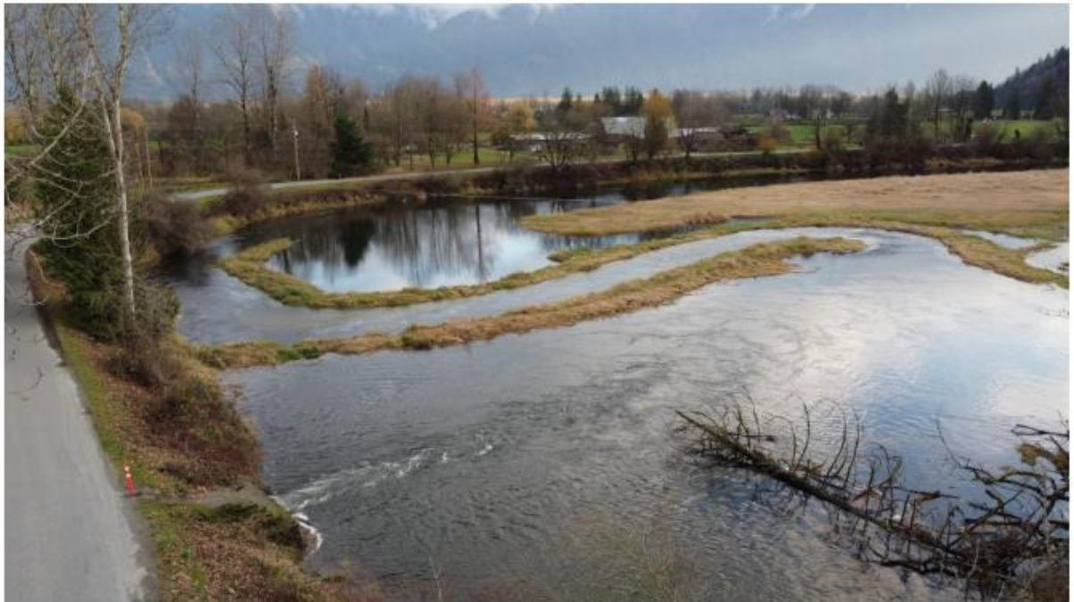
Site view showing downstream spawning channel and culvert outlet